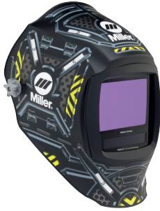
Black Ops™ 289715