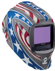
Stars and Stripes™ 288420