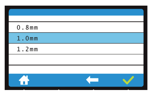
Step 4: Select your wire diameter