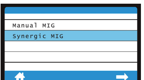
Step 1: Select your process