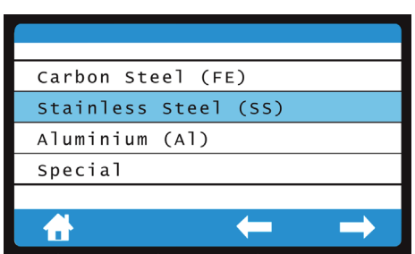
Step 2: Select your base material