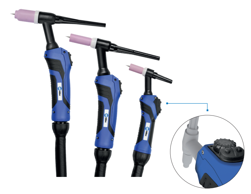
*Remote current control from the thumb wheel, available as an option on all models

Miller® recommends Miller® | Weldcraft® 2% lanthanated tungsten electrode. The blue electrode ensures a stable arc in both AC and DC processes, with greater longevity than conventional tungsten electrodes, the ability to use a smaller-diameter electrode for the same job, use of a higher current for a similar-sized electrode, and less tungsten spitting.