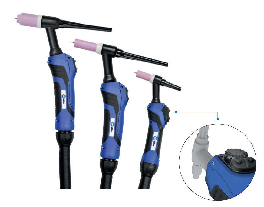
*Remote current control from the thumb wheel, available as an option on all models

The blue electrode ensures a stable arc in both AC and DC processes, with greater longevity than conventional tungsten electrodes, the ability to use a smaller-diameter electrode for the same job, use of a higher current for a similar-sized electrode, and less tungsten spitting.